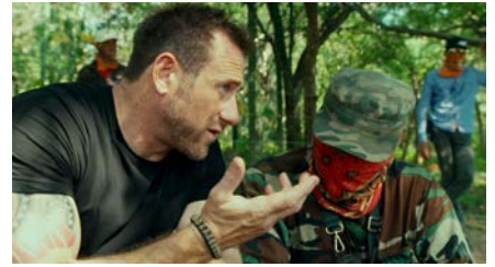
Vendetta - Truth, Lies and the Mafia NETFLIX | Nutopia