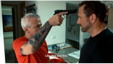
Inside the Real Narcos NETFLIX | Plum Productions