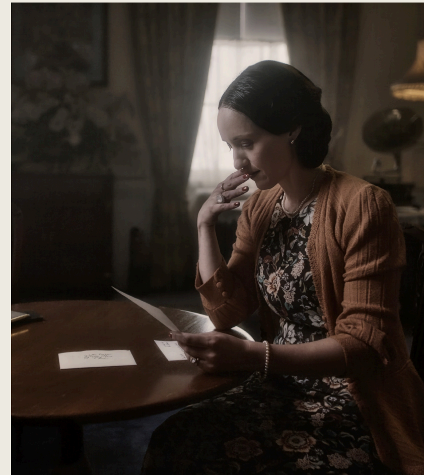
WALLIS: THE QUEEN THAT NEVER WAS ELEPHANT STUDIOS - CH5