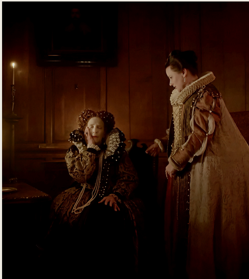
ROYAL AUTOPSY PHOENIX TV - SKY HISTORY

I trained in drama and narrative production, which continues to inform my approach to both documentary and scripted work. My short films have screened at festivals including Raindance, Cannes, and the London Short Film Festival, where they've been recognised for their visual style and sensitivity to performance. My documentary experience has recently expanded into drama-documentary and historical reconstruction, with credits including Royal Autopsy and feature length biogs on Prince Albert and Wallis Simpson. These projects have strengthened my ability to combine cinematic visual language with factual storytelling—delivering period-accurate sequences with depth, atmosphere, and clarity.