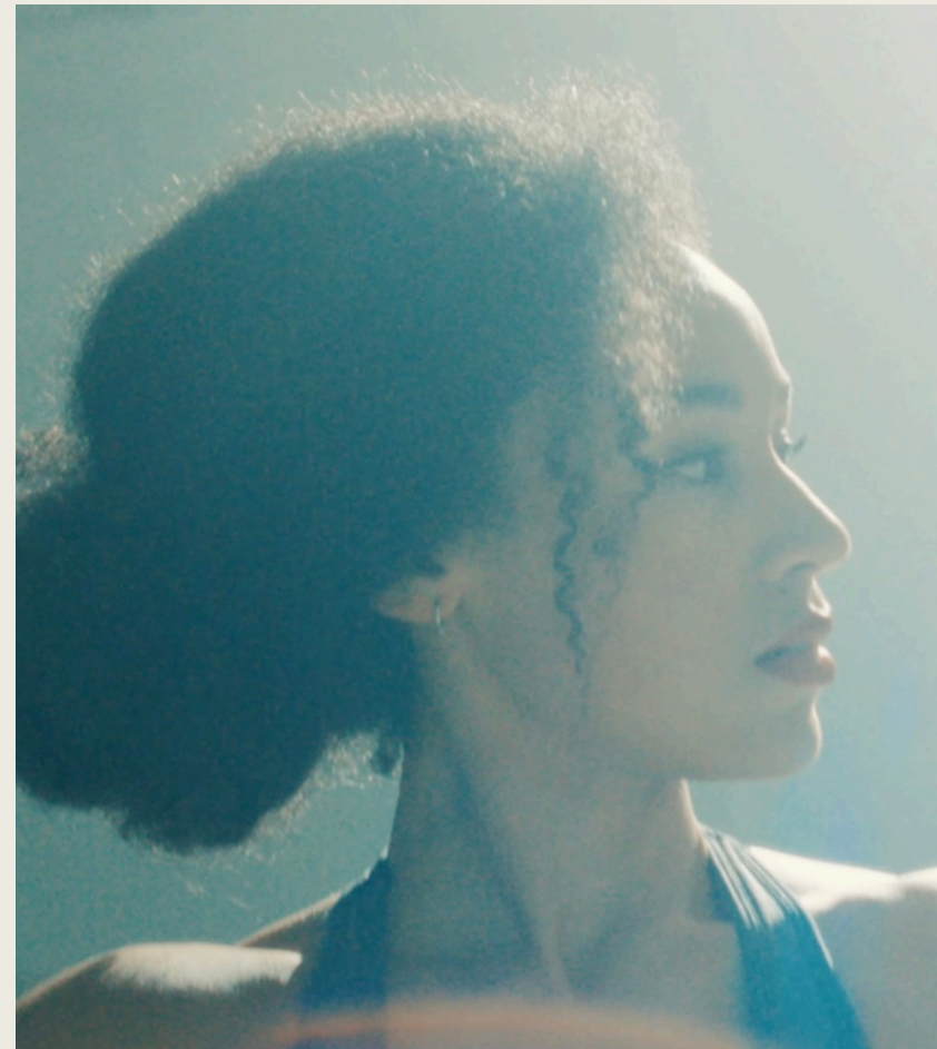
STYLIST - DIGITAL CAN YOU BE INSPIRED BY A SCENT