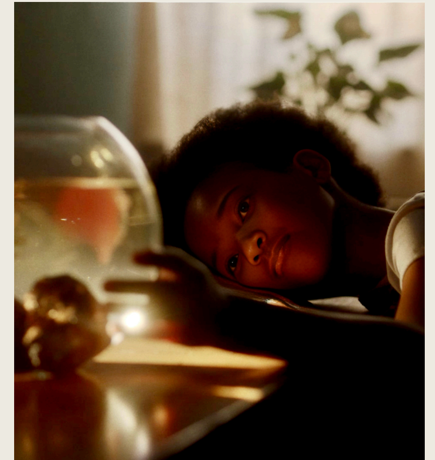
DHL - TVC DREAM BIG