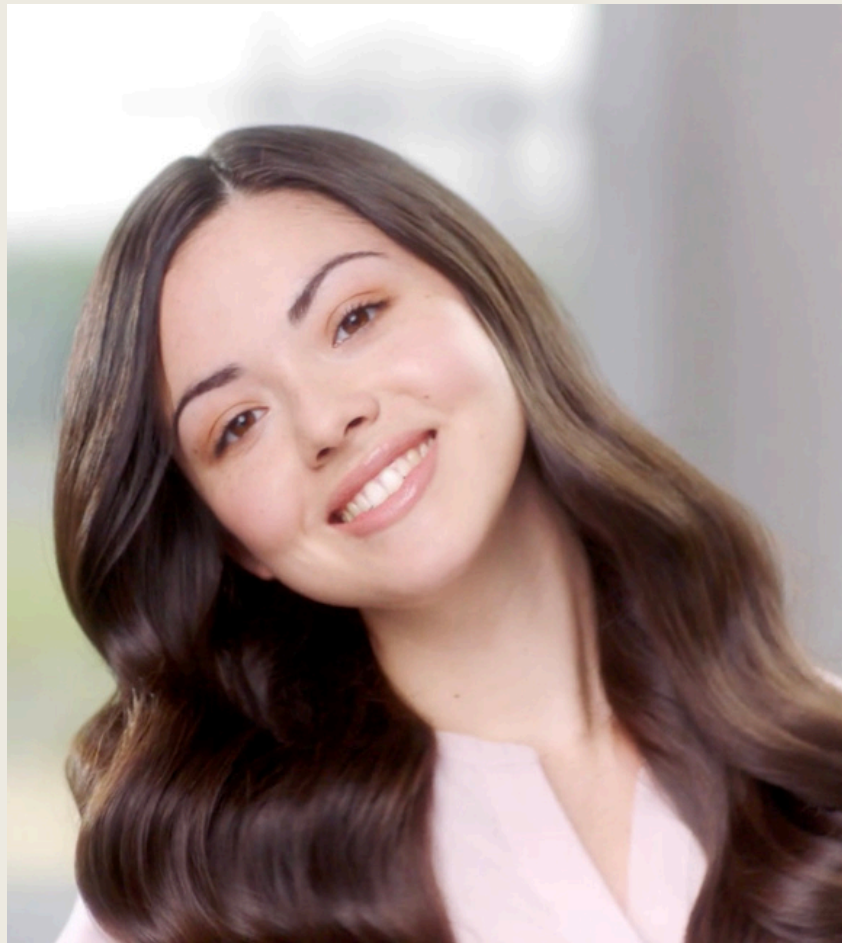
DOVE - TVC ENVIRONMENTAL DEFENSE

My commercial and brand portfolio includes global campaigns for major brands such as Dove, Stylist, LG, HSBC, Nestlé, Audi, EE, Royal Mail, Garnier, and Swarovski. These projects have taken me across diverse locations and creative briefs, delivering high-end content for commercial and digital platforms. The work has been featured in leading publications including Ad Age, TIME, The Huffington Post, AdWeek, Creativity, and The Guardian, with campaigns shortlisted for the ADCAN Awards – reflecting both creative impact and industry recognition.