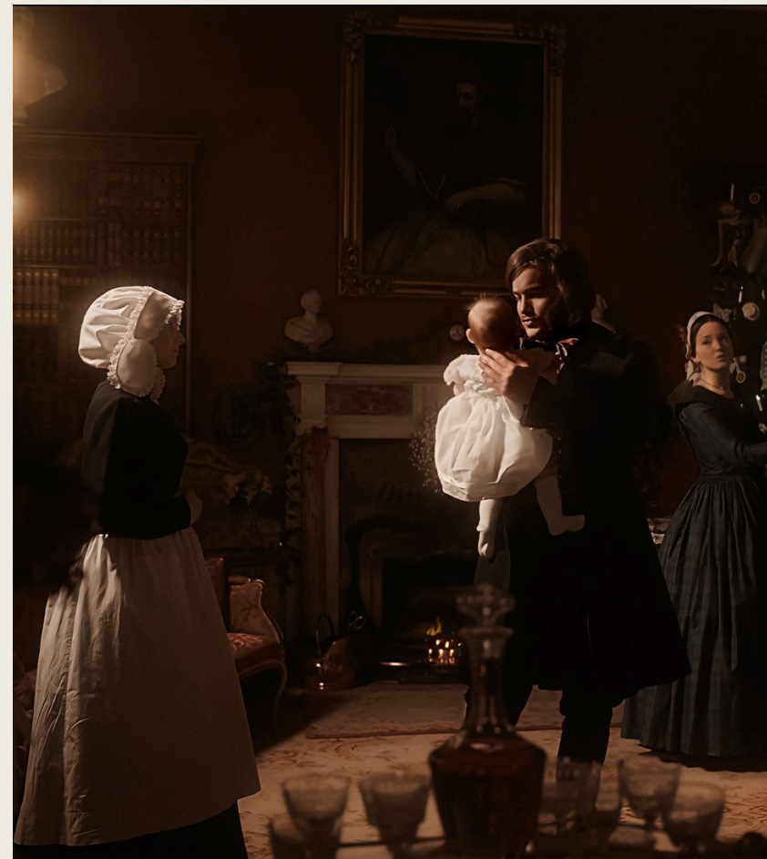
ALBERT: THE POWER BEHIND VICTORIA ELEPHANT STUDIOS - CH5/APPLE TV