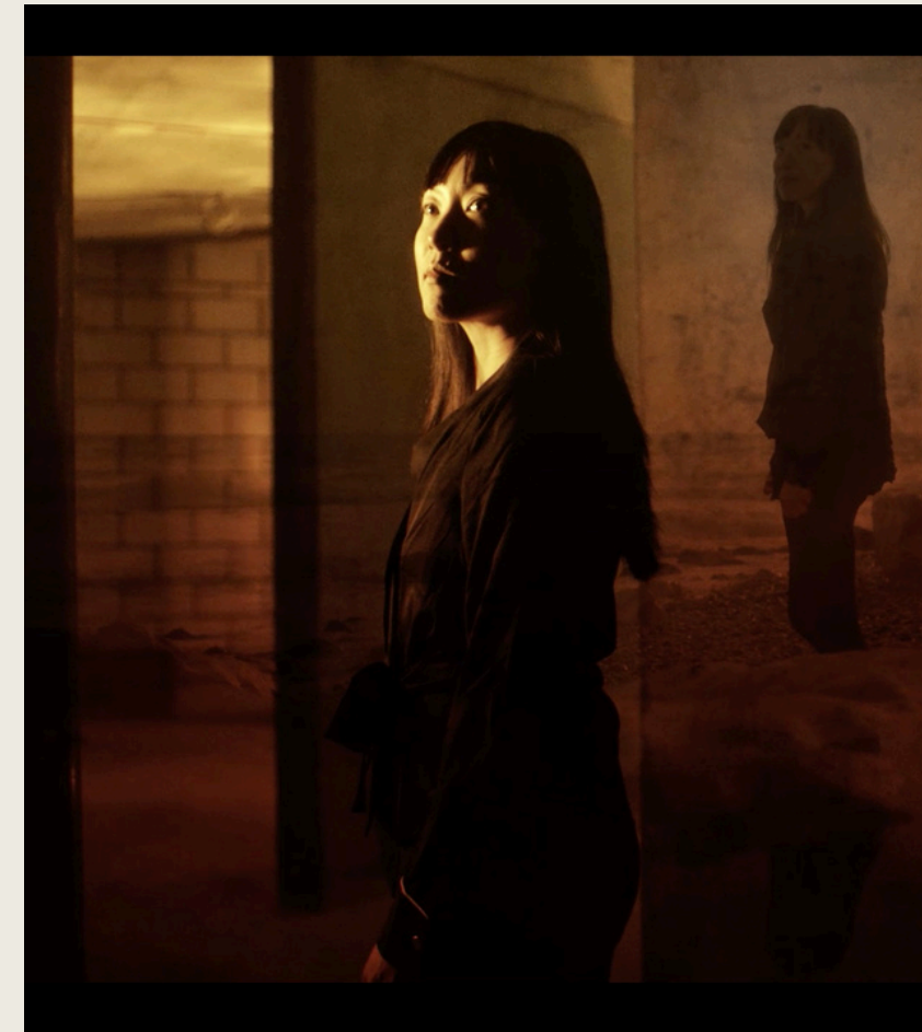
LG - DIGITAL THE ART OF ESSENCE